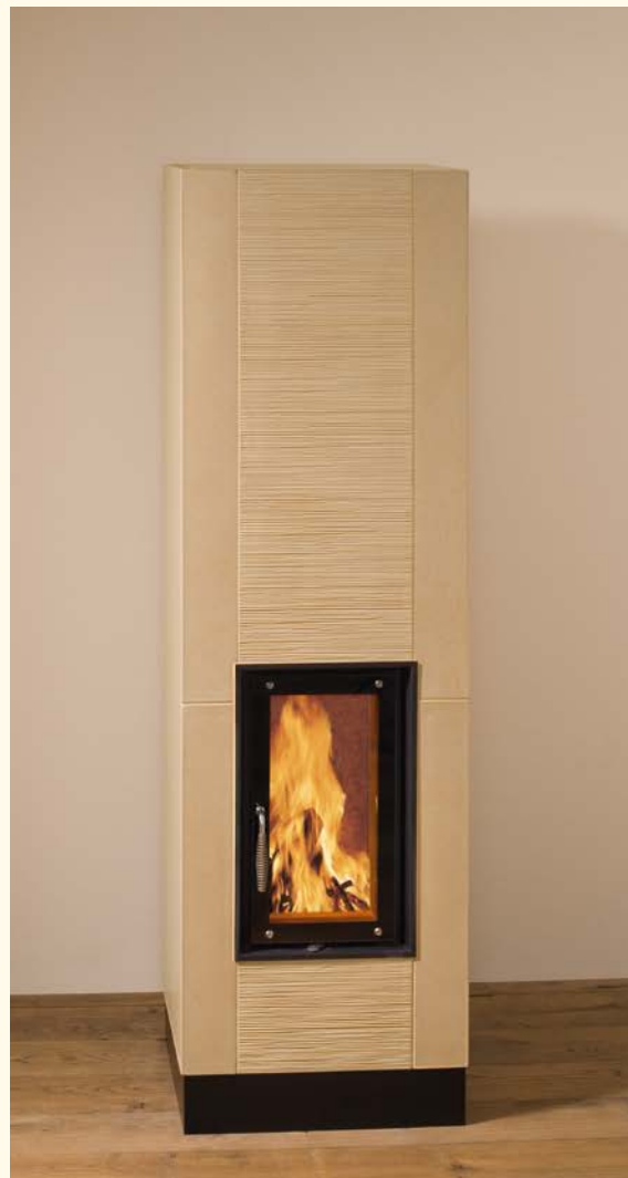
2072: Heat-storing tiled stove, square Glaze: sahara