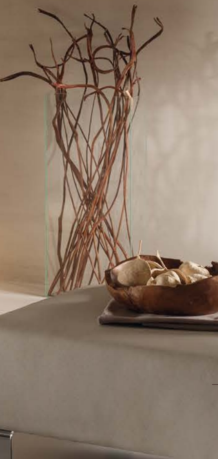
2097: fire shelf Soft 177 fire tiles MAXIMUS 241 Napa slab cornice 387 Glaze: hemp light with Terra pattern Technique: Brunner KE 610

Tiled stoves by Sommerhuber, the ceramics manufacturer, create a particular atmosphere exuding tranquility and coziness. The very special moments when we round off the day in front of a tiled stove, seeking the expanse of the calming fire and when we simply lose ourselves in thought – simply feel wonderful.