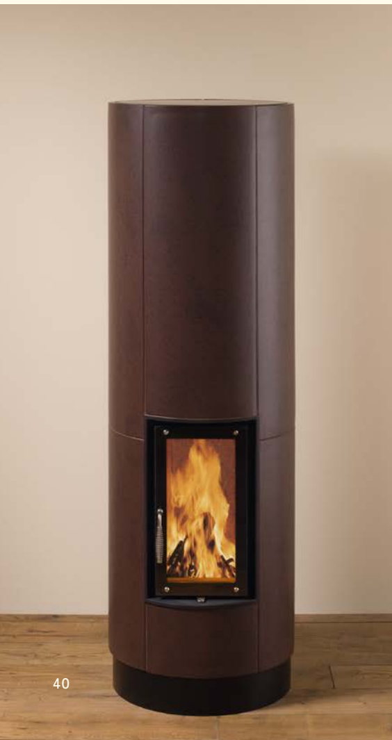
2071: Heat-storing tiled stove, round Glaze: umbra