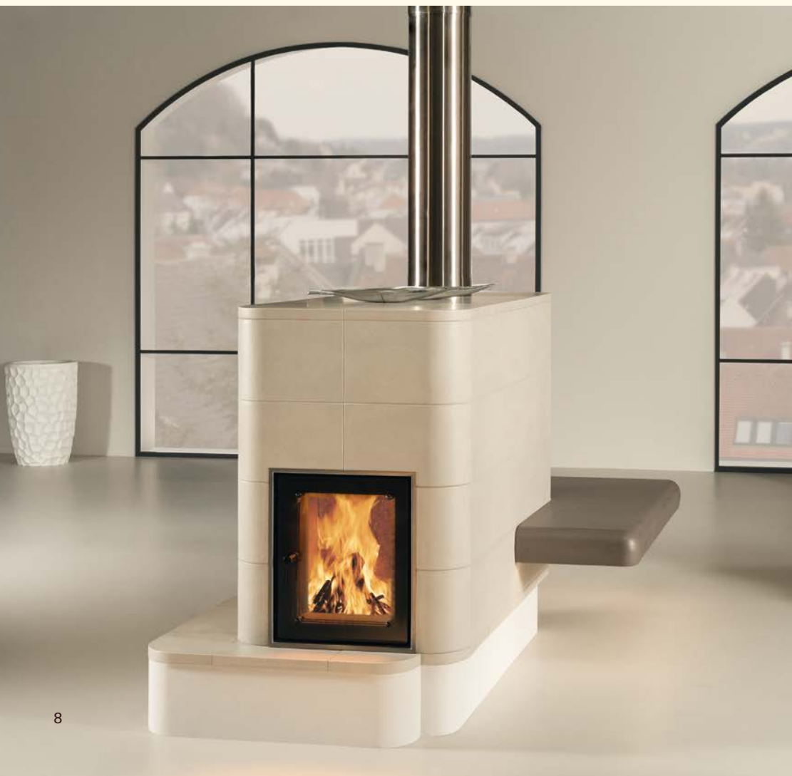
2092: fire shelf Soft 177 tile 378, slab cornice 387 Glaze: taupe dark, taupe light Technique: WGS KE 497

Reduction to the essential has always been a particular challenge. The large ceramic surfaces enable the clear implementation of the function of heating. REAL BIG TILES creates a unique ambiance.