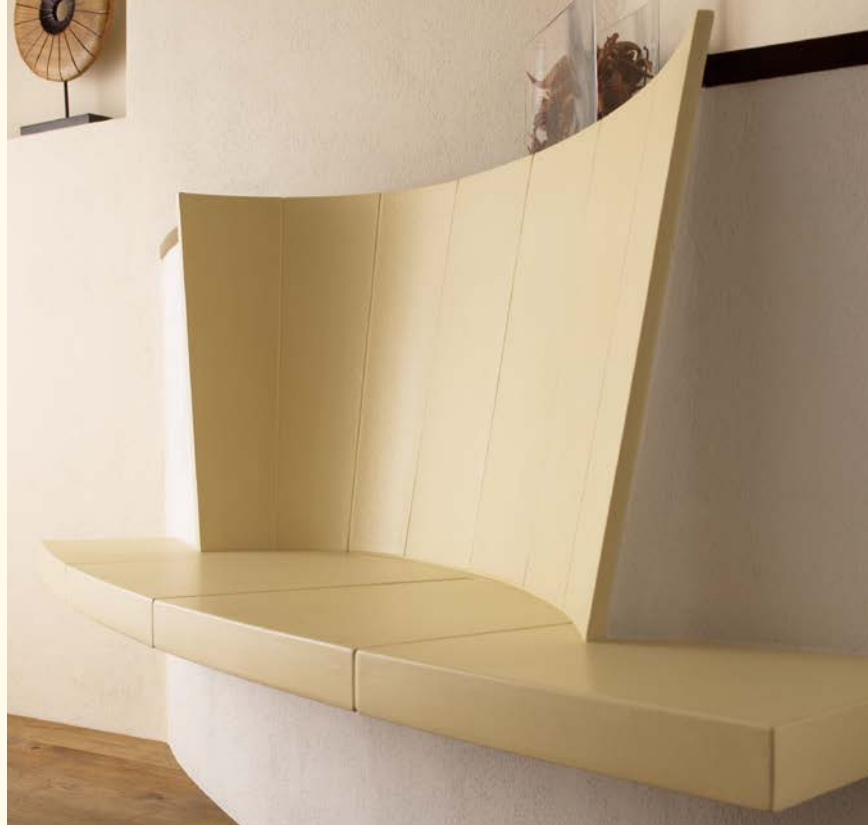
2047_1: fire shelf 179 backrest 378 Glaze: cacao dark, perla Technique: Brunner KE 351

"The Discovery of Slowness" – a wonderful book. Taking one's time to perform the activities of everyday life with the attentiveness they deserve - sitting together with friends and talking, reading a book or gazing absentmindedly into the fire. These are activities from which we draw strength for our everyday lives.