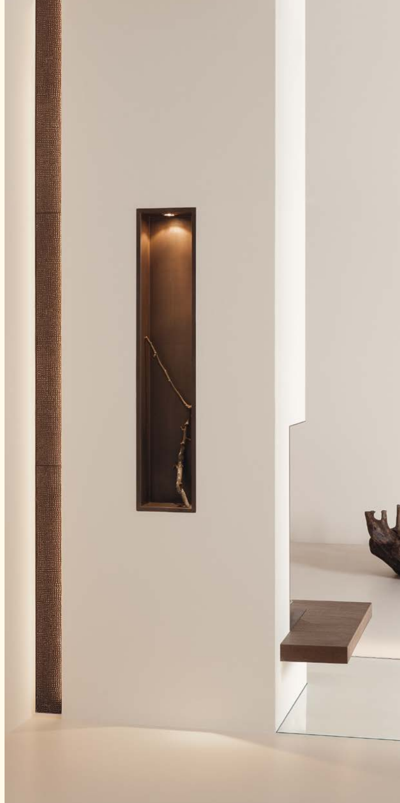
2106: fire shelf 178 REAL BIG TILES 378 Napa niche 284 Glaze: dark peat with Cotone pattern and dark peat Technique: Brunner KE 161,2