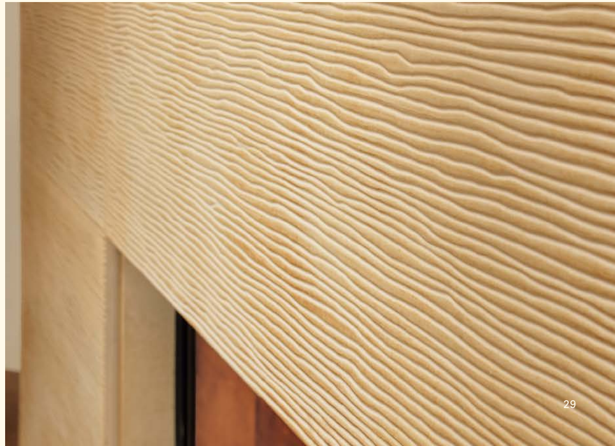
2044_2: fire tiles MAXIMUS flute lengthwise 241 Glaze: solnhofen Technique: Spartherm KE 240